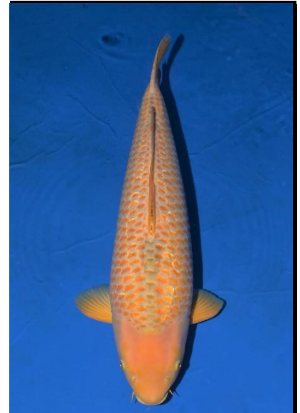
Type C Light Matsuba pattern (Mujimono) with Ginrin scales