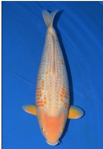
Type E Kanoko-patterned (Kawarimono) with Ginrin scales