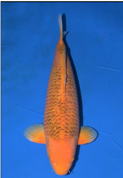
Type D Deep Matsuba pattern (Mujimono) with Ginrin scales