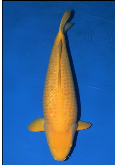
Type B Plain-colored (Mujimono) with Ginrin scales